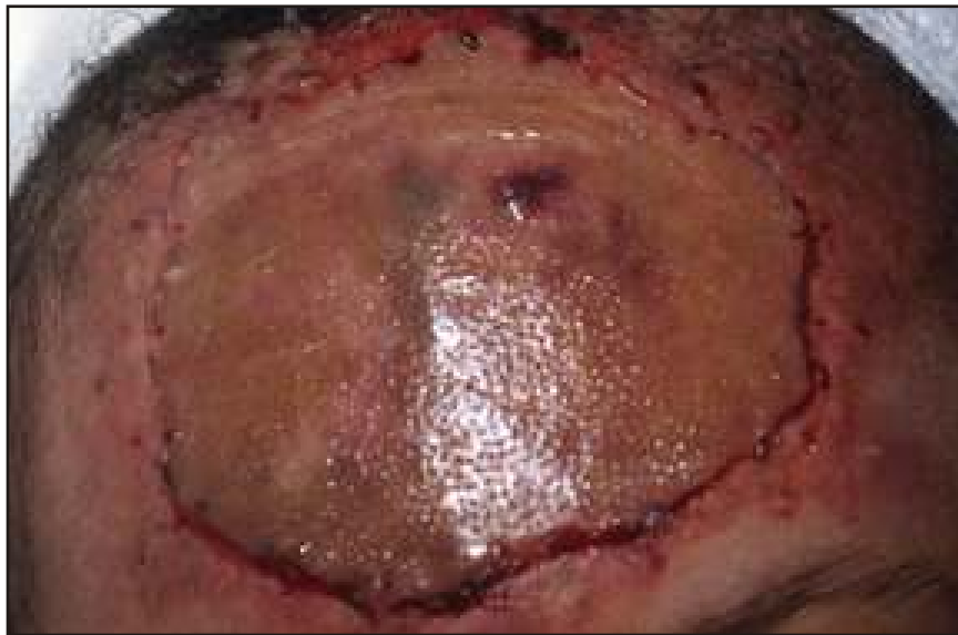
Figure 1: Post operative skin graft at 2 weeks