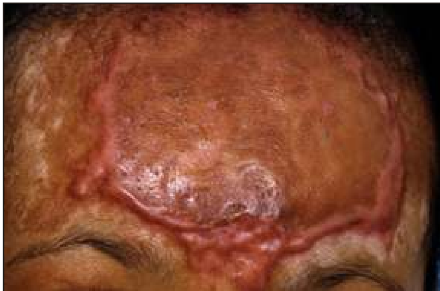
Figure 2: Scar presentation after 5 months of treatment with pressure alone