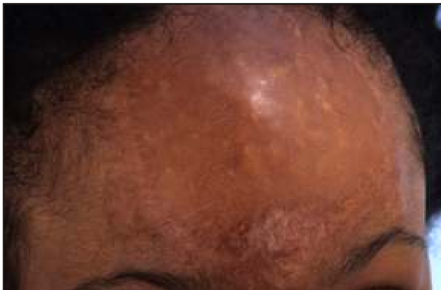
Figure 3: Final scar presentation after treatment with Silon-STS Forehead Mask