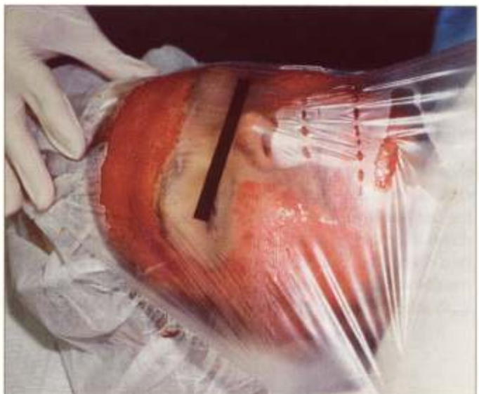
Figure 2: Polymer network dressing being applied as a face mask immediately after dermabrasion